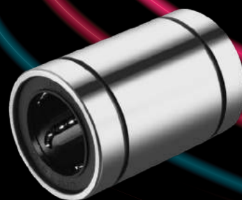
RHD LINEAR MOTION BEARING