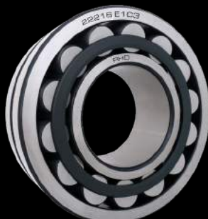
RHD SPHERICAL ROLLER BEARING