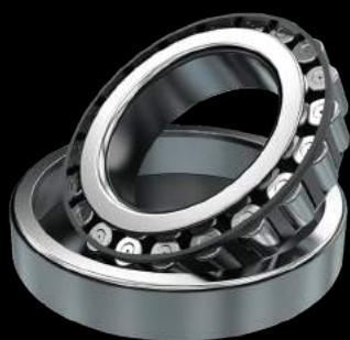
RHD TAPERED ROLLER BEARINGS